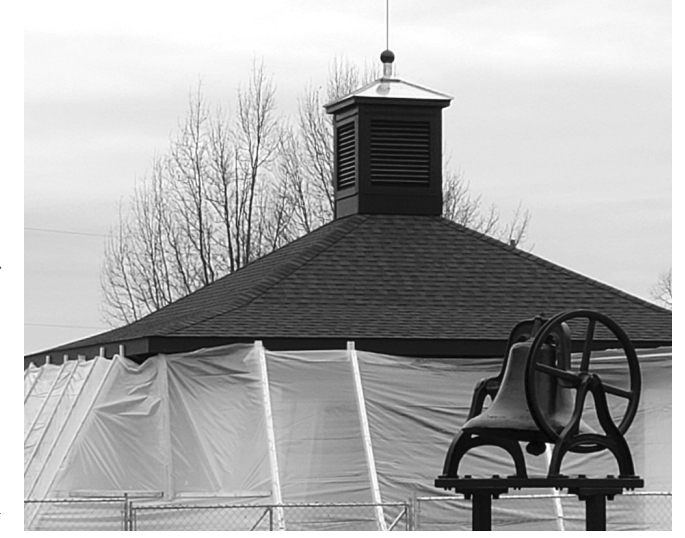
The result, when completed, will be a blending of the best of the design of the nearby lighthouse and recently constructed City Facilities building.

May 3, 7pm, East Jordan High School. 30th Annual Spring Concert.